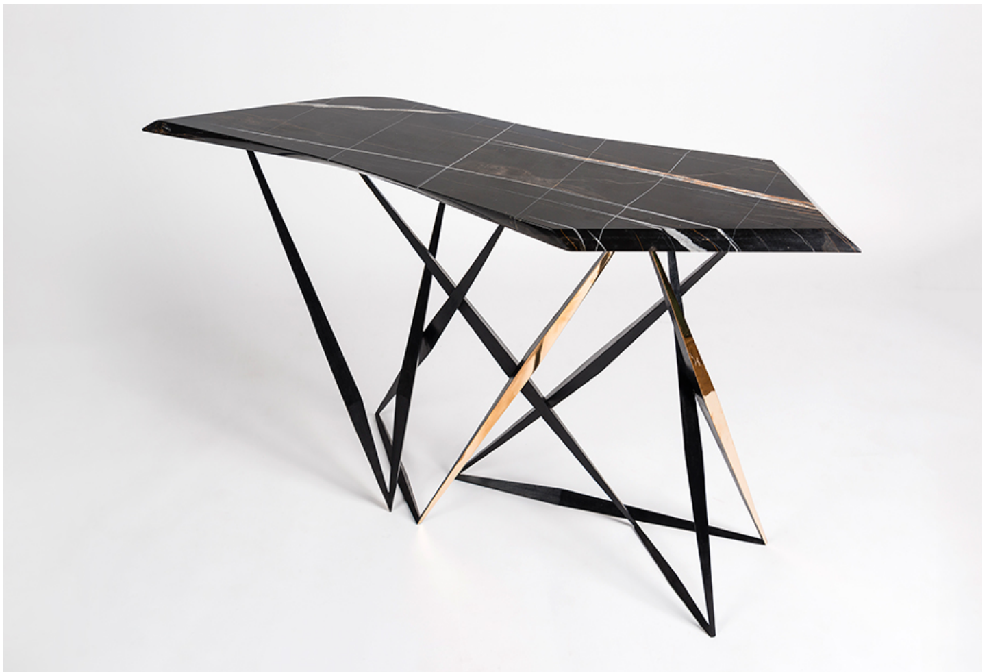
Tango console table, 2014