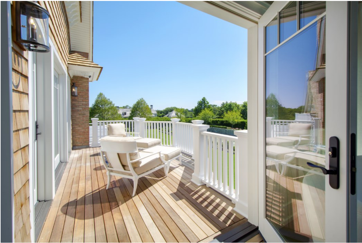
Master suite deck