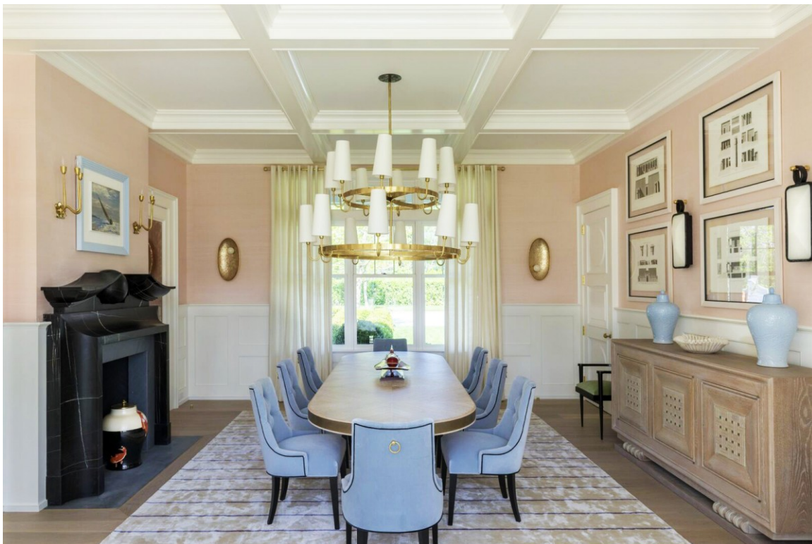
Formal dining room