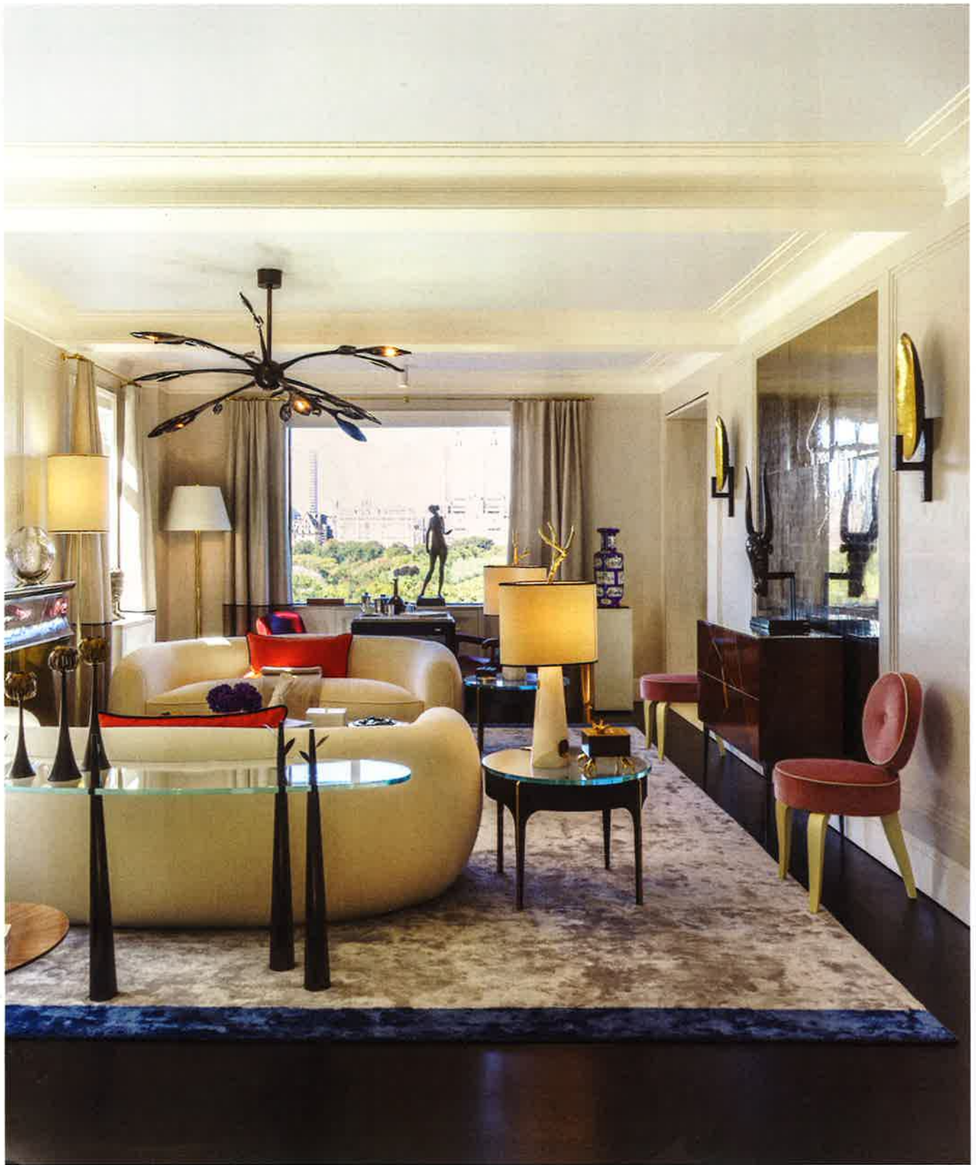
CHIC CHAMBERS ABOVE: The silk, hand-knotted rug designed by Salvagni and crafted in Tibet adds structure, and is flanked by a Hobbit console in bronze and glass and Tomaso Buzzi side chairs with parchment legs and velvet upholstery. The peacock wall sconce by Herve Van der Straeten is from Maison Gerard. OPPOSITE, TOP: The breakfast table was designed by Salvagni for the client and is surrounded by sculptural chairs by Jean Royère. The Artic Pear chandelier from Ochre hovers above. OPPOSITE, BOTTOM: A cabinet by Salvagni is inspired by the Roman Colosseum.