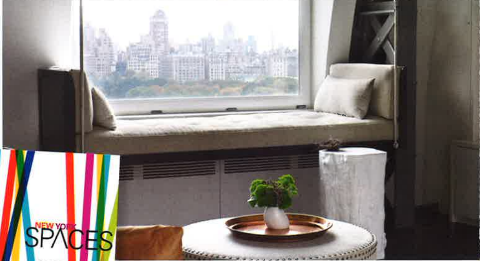
HIGH STYLE TOP TO BOTTOM: An architectural gem on the Upper West Side looks out over Central Park, and an Italian masterpiece has an Upper East perspective on the same treetops. Kelly Wearstler goes full fashion in the New York Design Center; Kelly Hoppen's plush plum armchair is deluxe.

I'M ALWAYS sorry to see summer go, but it's time to fall in love with New York City all over again. This is the season when fashion and design kick into high gear! At FIT, take in the dresses and accessories belonging to Marcel Proust's muse and 19th-century fashion icon Countess Greffulhe—fabulous in any century. Looking for Modern Love? David Bowie's art collection will be exhibited here before being auctioned by Sotheby's London in November. His reach extended from music and fashion to art and design.