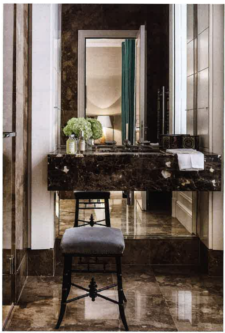
The master bedroom surprises with a bed niche lined in Elitis raw silk, and an Italian, 1880s commode painted with classic Hellenistic scenes in the neoclassical style. The marble-swathed guest bath introduces femininity with the carved chair found at a Paris flea market.