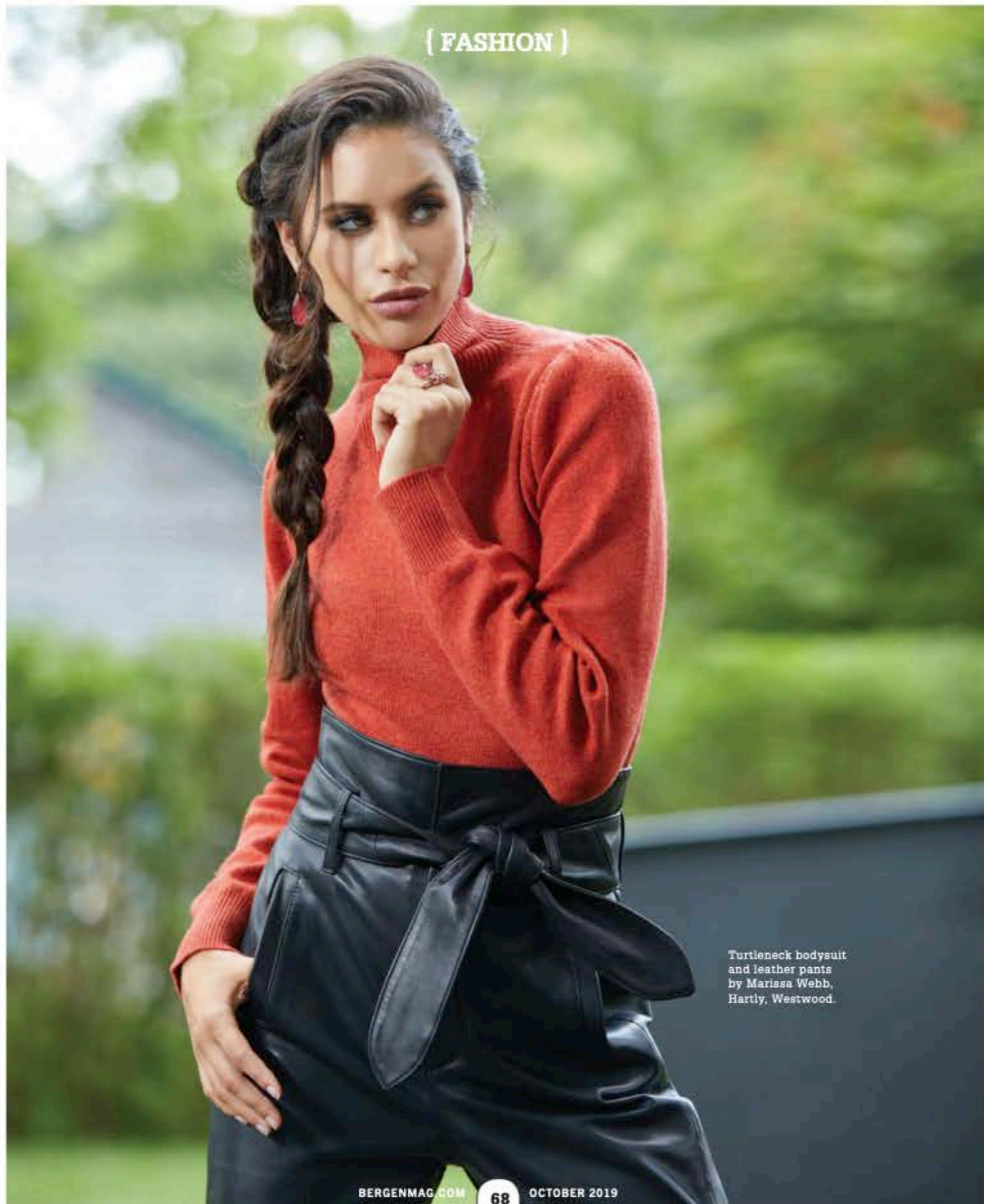
Turtleneck bodysuit and leather pants by Marissa Webb, Hartly, Westwood.