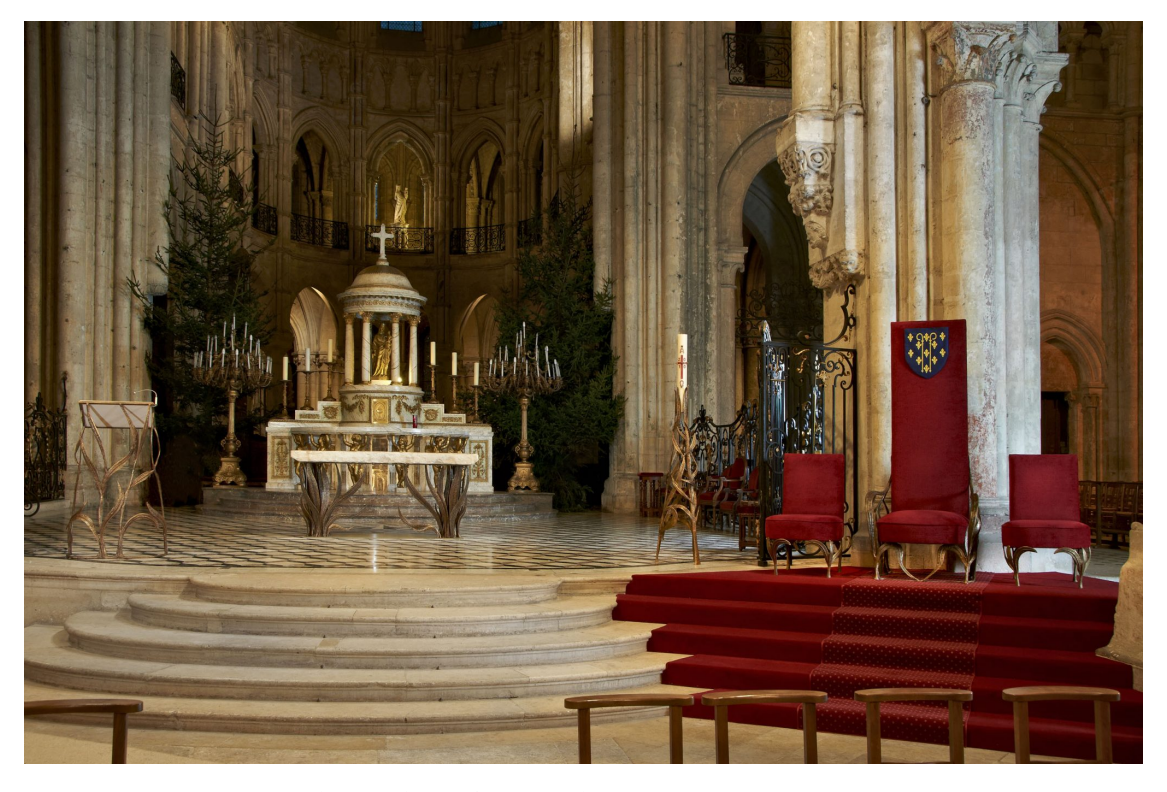
Commissioned to create the altar and liturgical furniture for the Cathedral of Notre-Dame in Noyon, France, Evennou chose the Biblical theme of the burning bush.

Similarly prestigious are a number of commissions Evennou has completed, such as a monumental door, a pair of torchères and an immense chandelier for the French ambassador's residence in Beirut; a table incorporating a marble plaque given to Jacques Chirac by the King of Morocco, which found its way into the French prime minister's official residence; and the high altar and liturgical furniture for the cathedral in Noyon, 60 miles northeast of Paris.