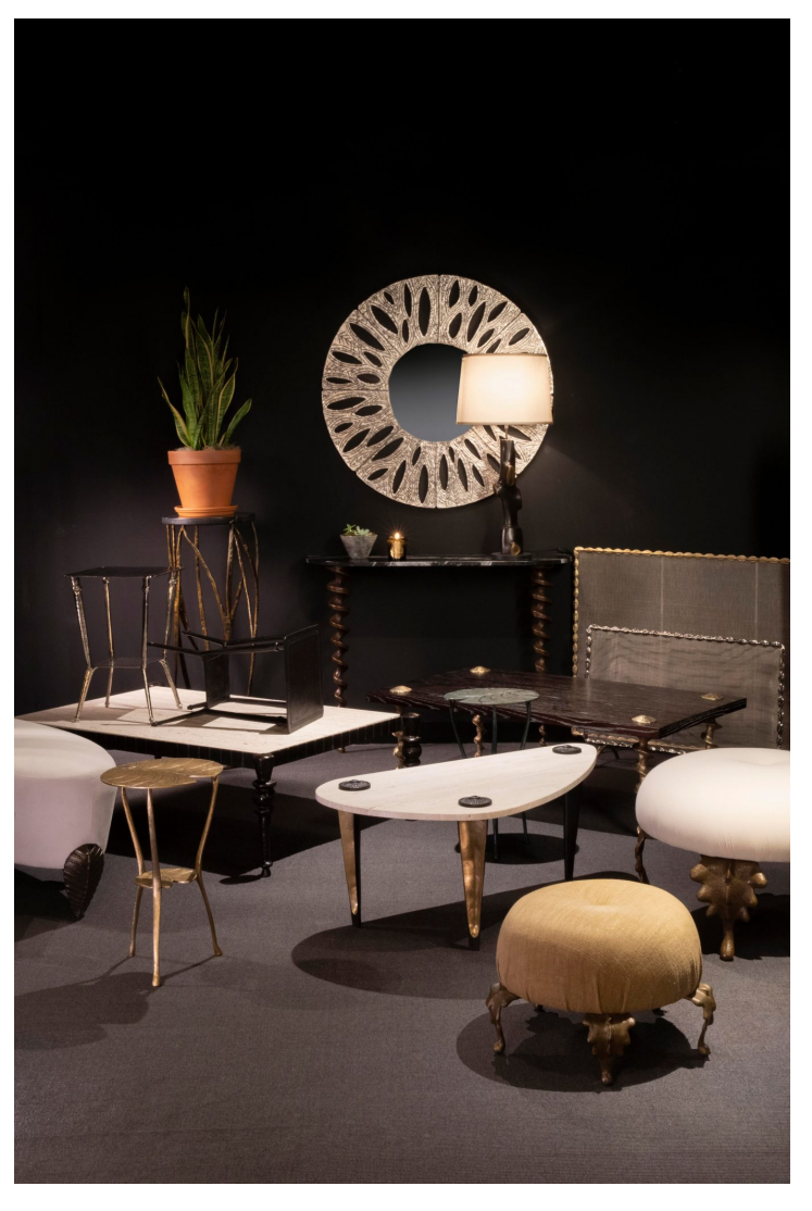
The natural world is a constant source of inspiration for Evennou, as seen in the details of several of his pieces at Bernd Goeckler, like the foliate legs on the <u>large</u> and <u>small pouts</u> at right.

Evennou's furnishings, meanwhile, are almost exclusively in bronze, which he pairs with materials like marble, crystal, alabaster and parchment. Their forms are more organic, derived mostly from the natural world. "It's an absolutely inexhaustible theme," he says. "The structures of plants — whether their branches, roots, pistils, flowers or leaves — are of tremendous beauty. They never fail to astound me."