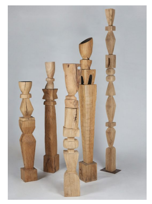
From left: The Phoenix side chair; a bronze and alabaster floor lamp; and a collection of the artist's wooden totems.