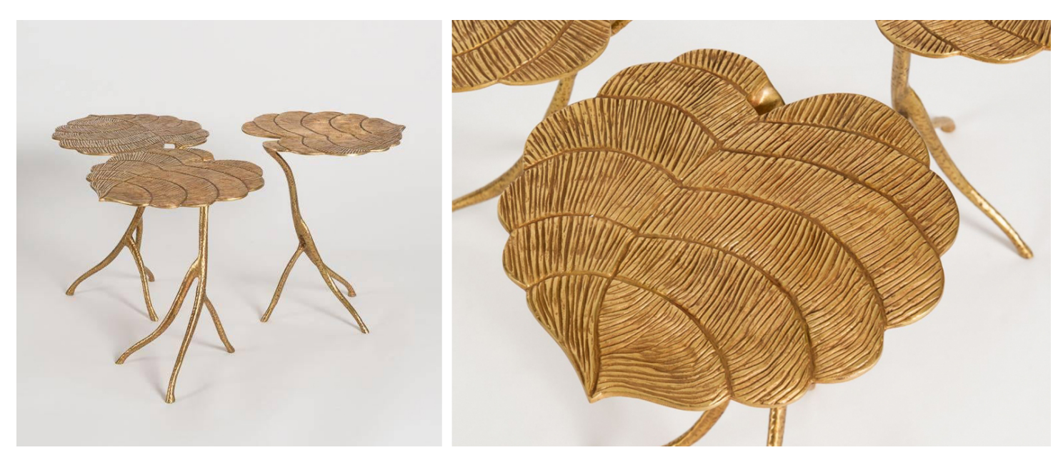
This set of nesting tables is modeled on the leaves and stems of the taro plant.

Similarly prestigious are a number of commissions Evennou has completed, such as a monumental door, a pair of torchères and an immense chandelier for the French ambassador's residence in Beirut; a table incorporating a marble plaque given to Jacques Chirac by the King of Morocco, which found its way into the French prime minister's official residence; and the high altar and liturgical furniture for the cathedral in Noyon, 60 miles northeast of Paris.