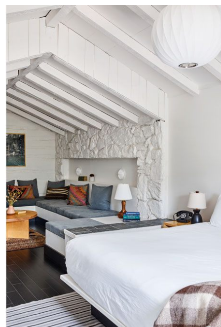
Views of the Scribner's Catskill Lodge's library and a guest room.