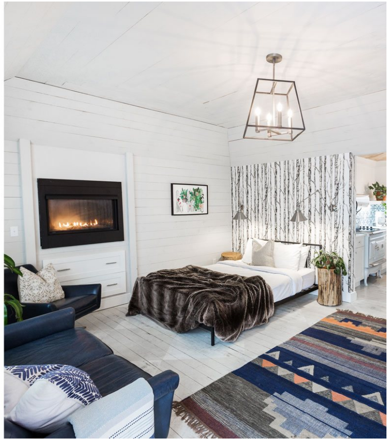
A brand-new farmhouse at Cedar Lakes Estate, as well as one of the property's guest rooms.