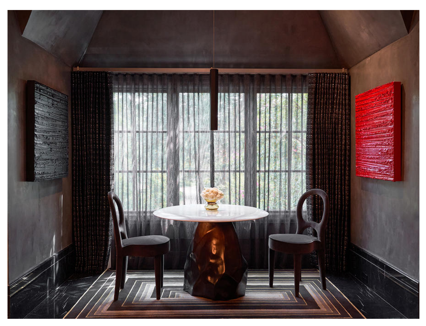
Lounge 13

In this ultradark seating nook, glossy finishes catch strokes of light, while matte textures in the rug and seating lend a softness to the entertainer's lounge.