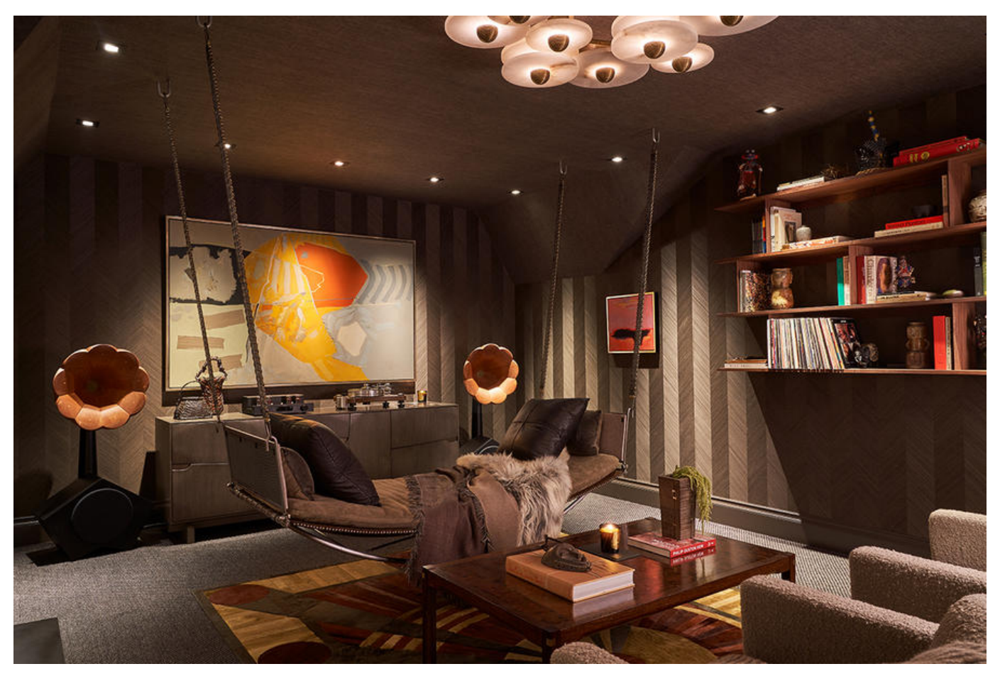
Hi-Fi Lounge

The pieces in this media center contribute a commanding sense of style, from the twin phonographs to the hanging bench seat.