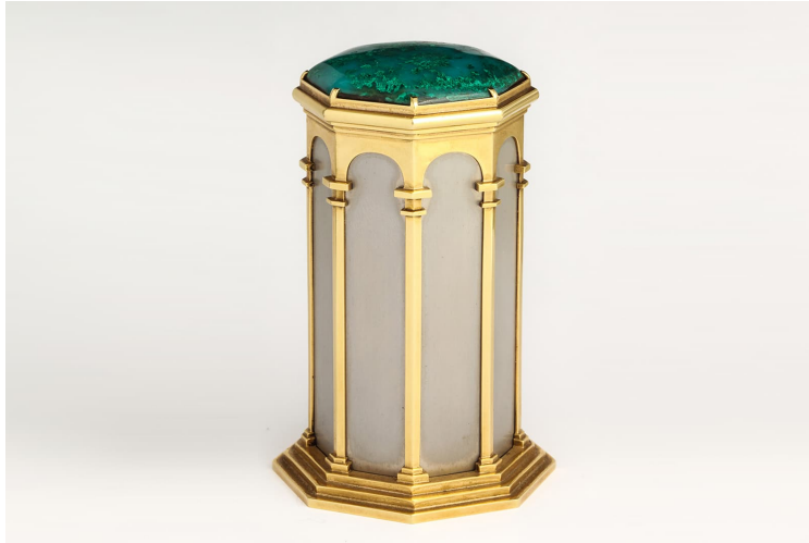
7 of 7 · Offered by A la Vieille Russie, Verdura objet d'art in yellow gold and palladium