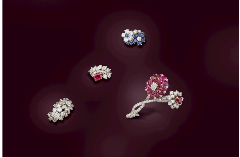
2 of 2 • Offered by S.J. Phillips, a selection of jewels by Cartier with rubies, sapphires and diamonds in platinum

In combination with the jewellers attending TEFAF Maastricht 2020, these dealers are set to create an incredible selection of important jewels for aficionados and admirers from all over the world to enjoy between March 7th and 15th.