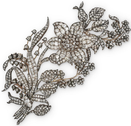
1 of 4 • Offered by Wartski, diamond tremblant spray brooch with old brilliant cut diamonds, set in silver and mounted on yellow gold, circa 1840

Wartski have chosen to demonstrate their expertise in antique jewellery at TEFAF Maastricht 2020 with a diamond en tremblant spray brooch with old brilliant cut diamonds, set in silver and mounted on yellow gold, circa 1840. Another antique piece which is sure to pique the interest of visitors is a Etruscan revival bracelet by Castellani; decorated with filigree and carnelian intaglios, joined by hinged pearl mounted links, and created circa 1870.