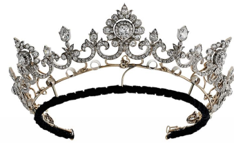
2 of 7 · Offered by Hancocks London, the transformable Anglesey tiara with over 100ct of diamonds, formerly belonging to the 'Dancing Marquess' circa 1890