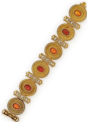
3 of 4 • Offered by Wartski, Castellani Etruscan revival bracelet with pearls and carnelian intaglios in yellow gold, circa 1870