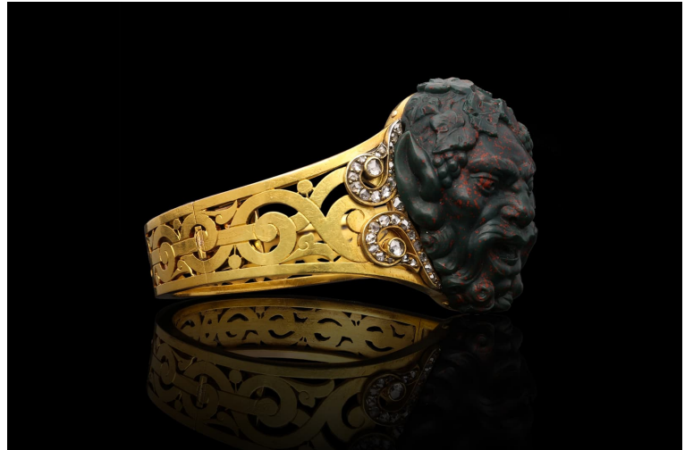
6 of 7 · Offered by Hancocks London, Victorian bracelet with bloodstone and diamonds in yellow gold circa 1880