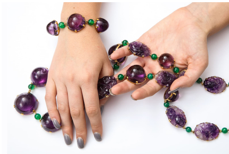
1 of 7 • Offered by A la Vieille Russie, René Boivin necklace and bracelet with carved amethyst and chrysoprase beads in yellow gold

A New York City-based antique dealer with Russian roots and French heritage, A la Vieille Russie specialises in antique jewellery, Imperial Russian works of art, and objets d'art. The stand-out pieces for their TEFAF presentation include a Jean Schlumberger for Tiffany&Co. suite of peridot decorated earrings and complementing brooch, both with diamonds in yellow gold; a sumptuous pair of Cartier two-tone citrine clips; a René Boivin carved cabochon amethyst and chrysoprase sautoir and matching bracelet circa 1950, as well as an exceptional amethyst collet necklace from 1790.