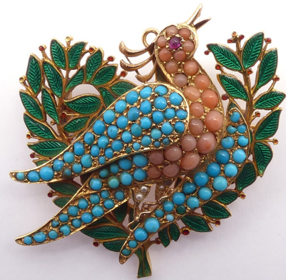
2 of 4 • Offered by Wartski, Giuliano brooch with coral, turquoise, rubies, pearls and enamel in yellow gold