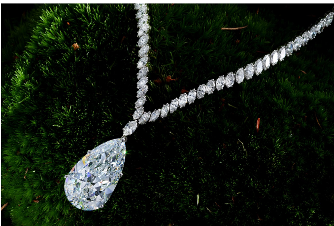
1 of 4 · Offered by Symbolic & Chase, Harry Winston necklace owned by Cristina Onassis with 38ct central pear cut diamond and accenting diamonds in platinum