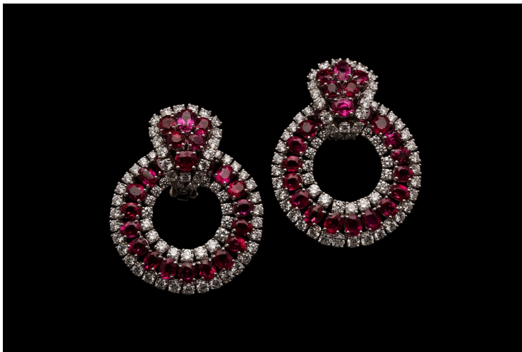
7 of 7 • Offered by Hancocks London, Bulgari earrings with diamonds and rubies in white gold