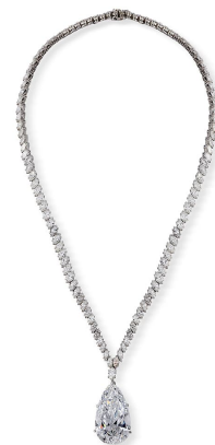
2 of 4 · Offered by Symbolic & Chase, Harry Winston necklace owned by Cristina Onassis with 38ct central pear cut diamond and accenting diamonds in platinum