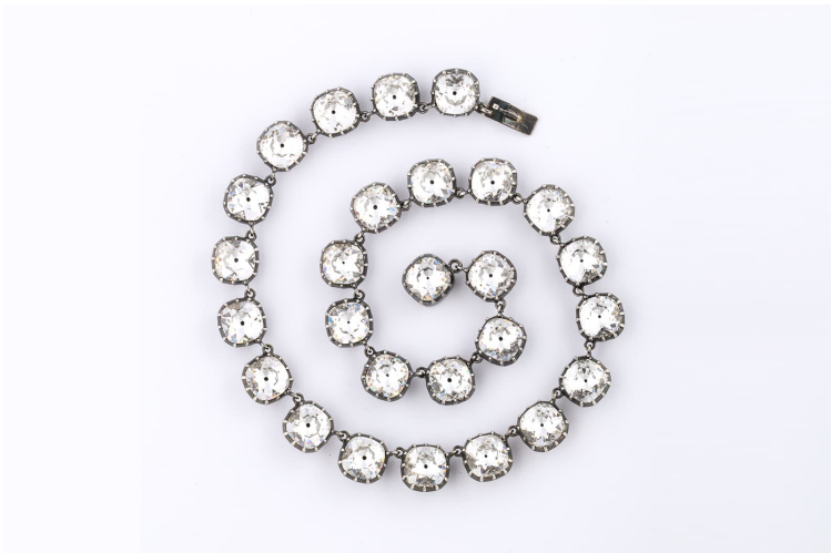
3 of 7 • Offered by A la Vieille Russie, necklace with rock crystals in silver, circa 1870