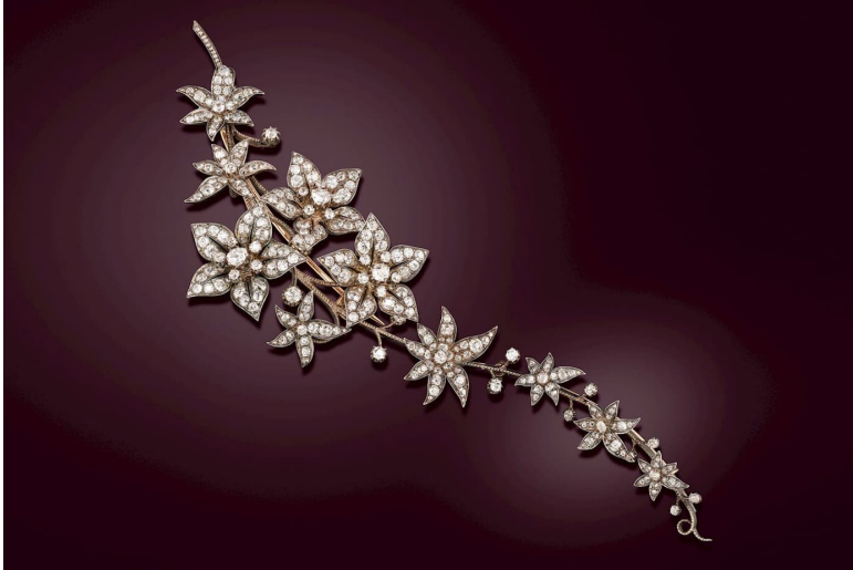
1 of 2 • Offered by S.J. Phillips, Henri Vever en tremblant brooch with diamonds in yellow gold and silver, circa 1860