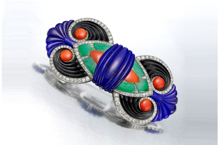
2 of 3 • Offered by FD Gallery, Boucheron Art Deco devant de corsage brooch with lapis lazuli, coral, jade, onyx, and diamonds in platinum, circa 1925