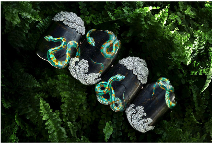
3 of 4 • Offered by Symbolic & Chase, Vangard bracelet with carbon fibre, micro mosaic and diamonds in bronze, white gold and silver