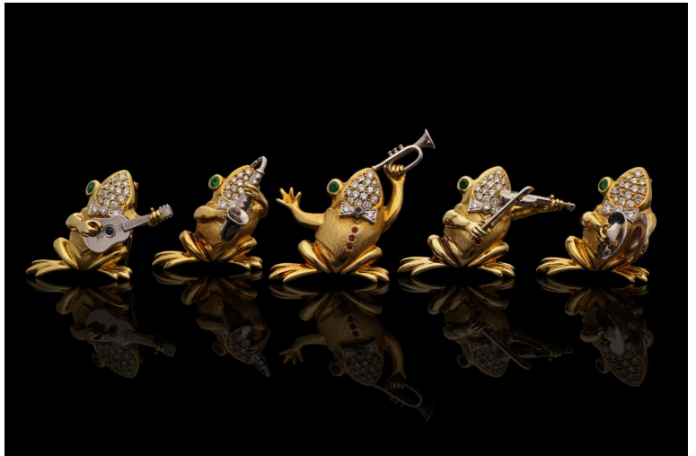
4 of 7 · Offered by Hancocks London, E. Wolfe set of frog brooches with diamonds, emeralds, sapphires and rubies in yellow and white gold