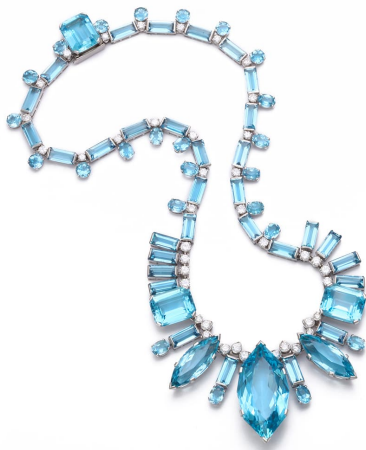
5 of 7 · Offered by A la Vieille Russie, necklace with aquamarine and diamonds in white gold