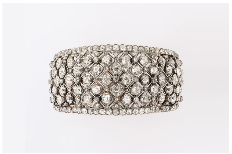
6 of 7 · Offered by A la Vieille Russie, bangle with old mine diamonds in silver and yellow gold, circa 1880