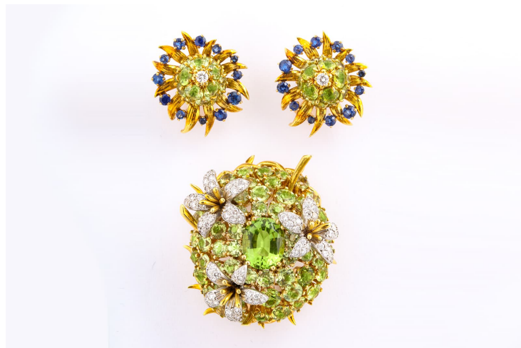
4 of 7 • Offered by A la Vieille Russie, Jean Schlumberger for Tiffany&Co. earrings with sapphires, and both with peridot and diamonds in yellow gold