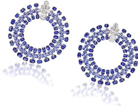
3 of 3 • Offered by FD Gallery, Sabba earrings with sapphires and diamonds in platinum and gold