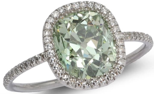
4 of 4 • Offered by Symbolic & Chase, JAR ring with 2.49ct yellowish-green diamond, accented with colourless diamonds in platinum