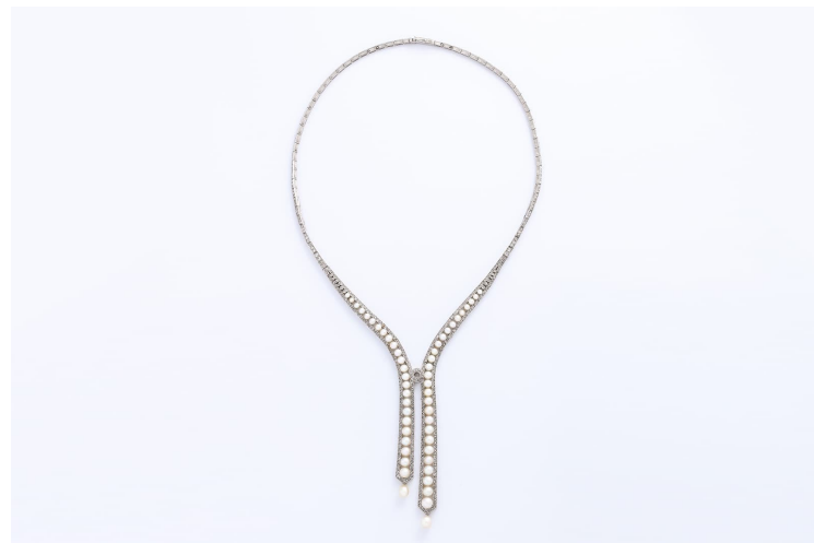
2 of 7 • Offered by A la Vieille Russie, necklace with natural pearls and diamonds in white gold circa 1910