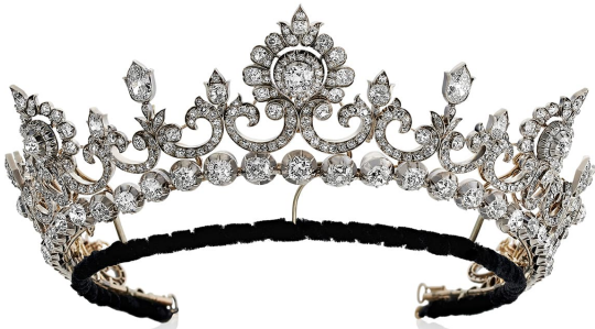
1 of 7 · Offered by Hancocks London, the Anglesey tiara with over 100ct of diamonds, formerly belonging to the 'Dancing Marquess' circa 1890