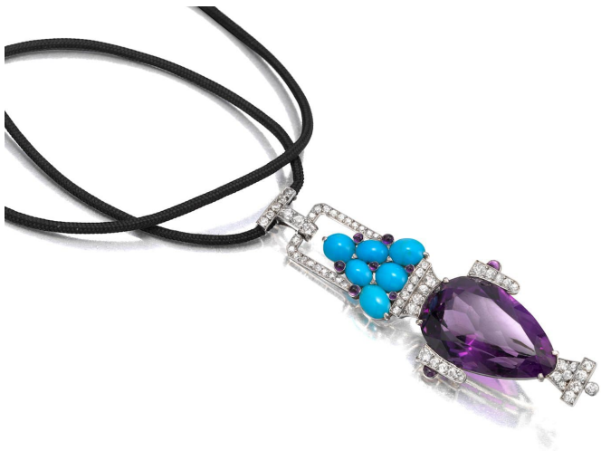
1 of 3 • Offered by FD Gallery, Cartier Art Deco pendant with amethyst, diamond and turquoise in platinum, circa 1915

The treasures which are being brought to TEFAF Maastricht courtesy of another New York jewellery dealer - FD Gallery - are a broad range of jewels spanning the 20th and 21st centuries. Modern master Sabba is represented with a pair of sapphire and diamond earrings in platinum and gold. Created almost a century earlier, FD Gallery is also exhibiting a Boucheron art deco Devant de Corsage Brooch from 1925, incorporating the oriental aesthetic which became popular during this era in fine art; featuring carved lapis lazuli, coral, jade, onyx, and diamonds. The brooch was created for the Paris Exposition de Arts Decoratifs of 1925, and was a collaboration of Boucheron's finest names - designed by Lucien Hirtz, mounted by Bisson, with lapidary work by Brethiot.