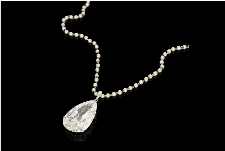
3 of 7 · Offered by Hancocks London, a pendant with 20.20ct old cut pear-shaped diamond, accenting diamonds and pearls in platinum