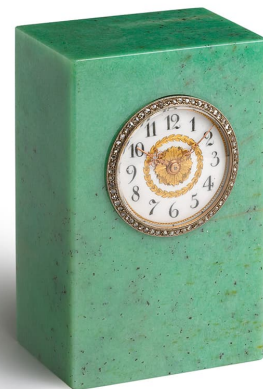
4 of 4 • Offered by Wartski, Fabergé clock with nephrite, diamonds and enamel in yellow gold