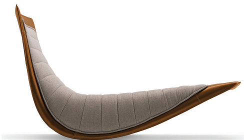
Zanotta's 2020 Back to Emotions collection invokes a smile with the Rider lounge by Ludovica+Roberto Palomba. A simple leather-covered rocking seat with channelled upholstery resembles a roly-poly bug starting to curl up at the slightest touch. From $10,000; zanotta.it