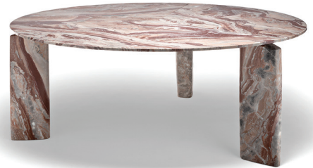
Massimo Castagna's Giotto outdoor dining table for Exteta celebrates marble in a boldly sculptural way. It's all carved stone (three types of marble available), imparting weight and volume within a lean profile. $44,750; ddcnyc.com