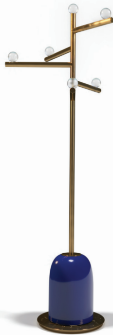
Piero Angelo Orecchioni's array of Pins lighting and tables for Marioni , to which he just introduced a new lamp and a coat stand, recalls Italian humor of the 1980s Memphis movement. Made of glazed ceramic and satin-finish glass. $700–$2,700; marioni.it