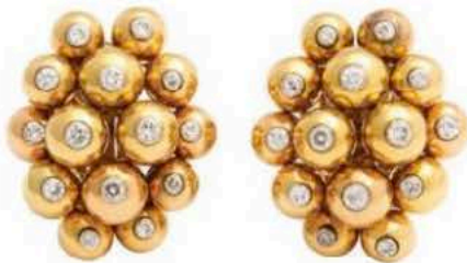
Cartier 1950s gold and diamond cluster earrings, $62,500; alvr.com